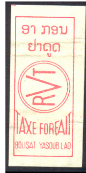
B5d -- red on white "RVT" in center $25.