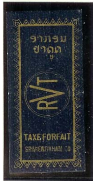
B5a -- gold on navy blue "RVT" in center $25.