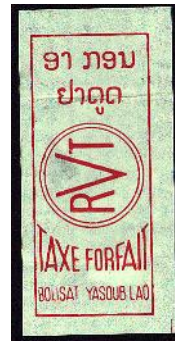
B5c -- red on light blue "RVT" in center $25.