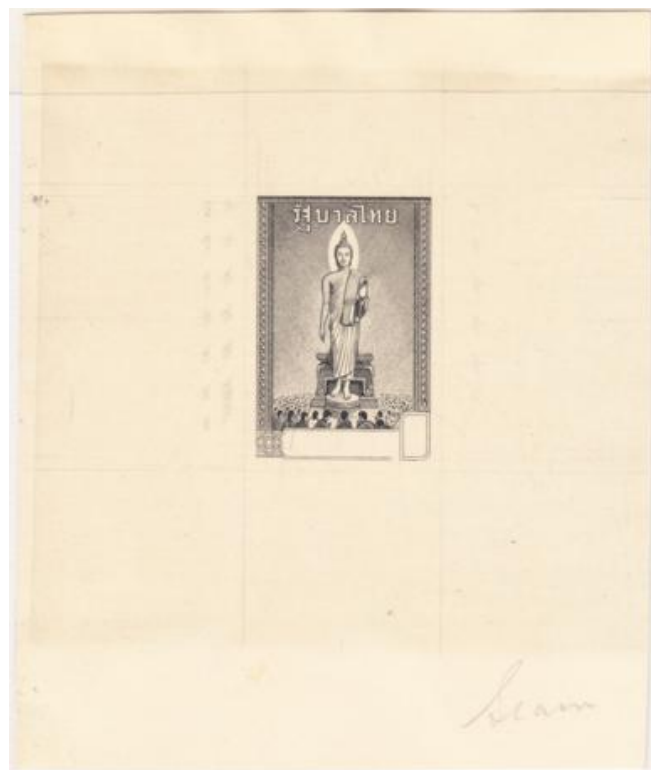
Master die proof in black.