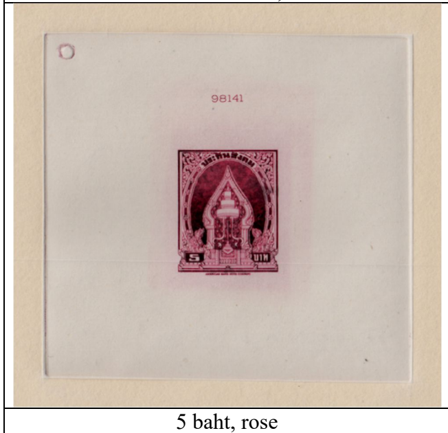
5 baht, rose