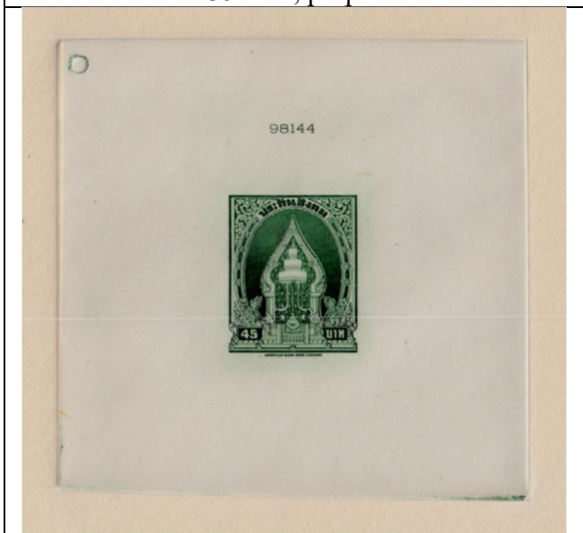
45 baht, green